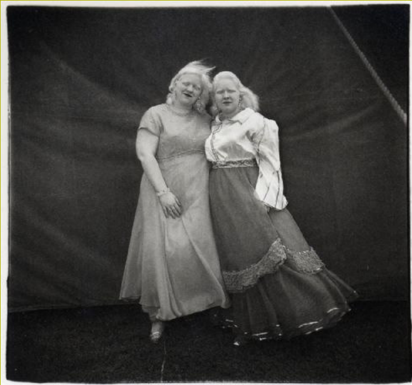
Diane Arbus, Albino Sword Swallower with Her Sister, MD, 1970