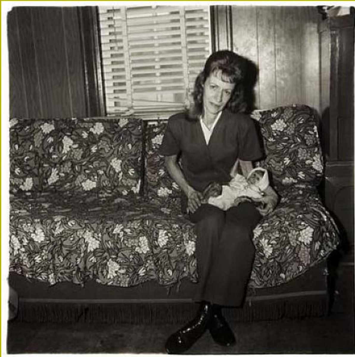
Diane Arbus, Woman with a Baby Monkey, 1971