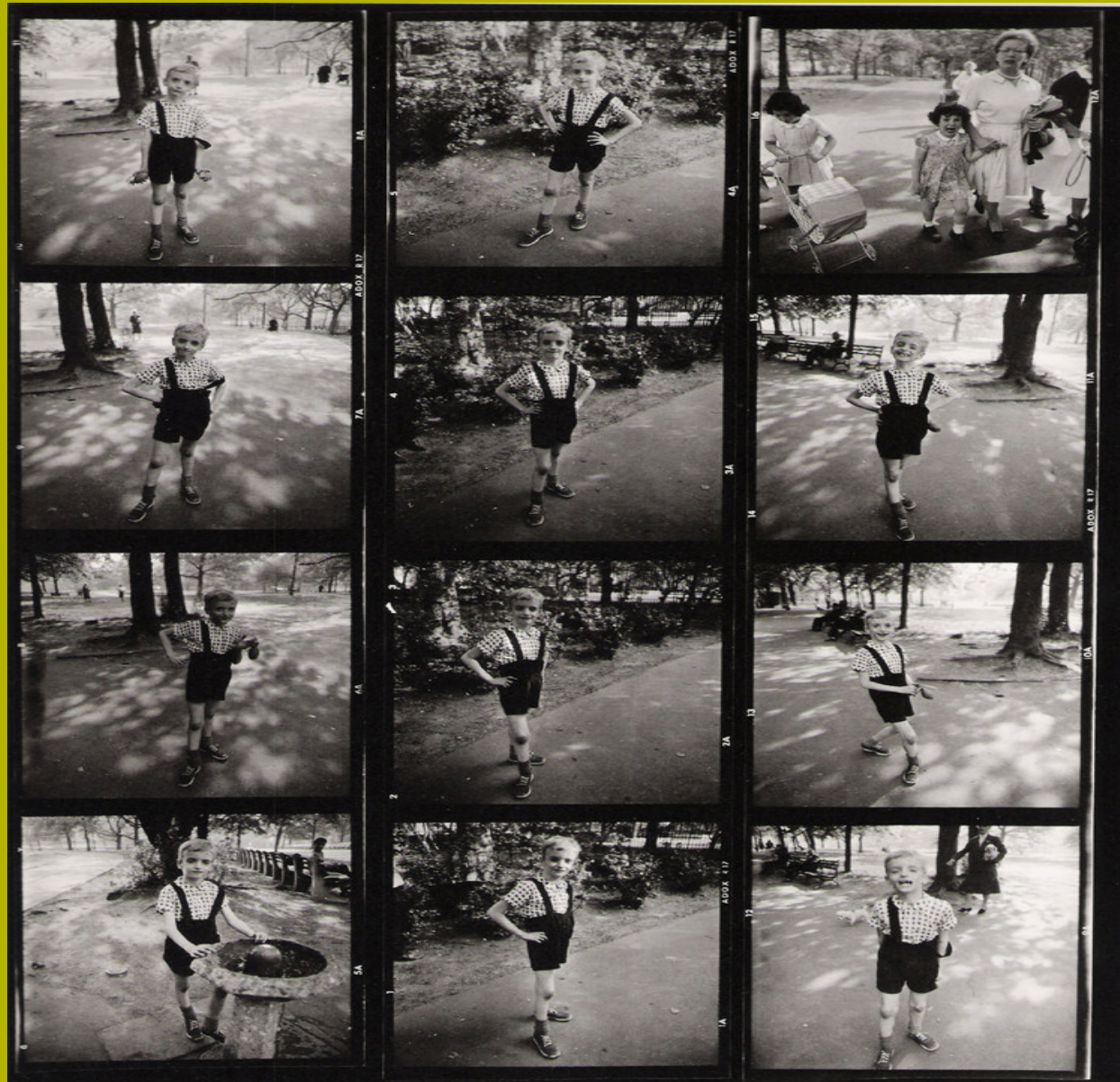
Diane Arbus, Child With Hand Grenade Toy Contact , 1962