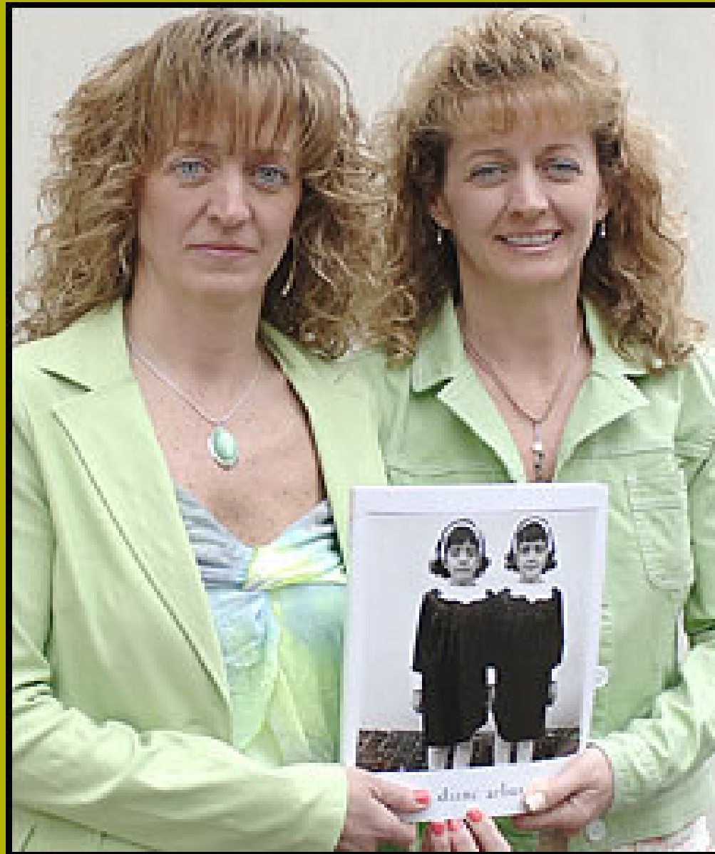
Identical Twins Now, The Washington Post , 2005