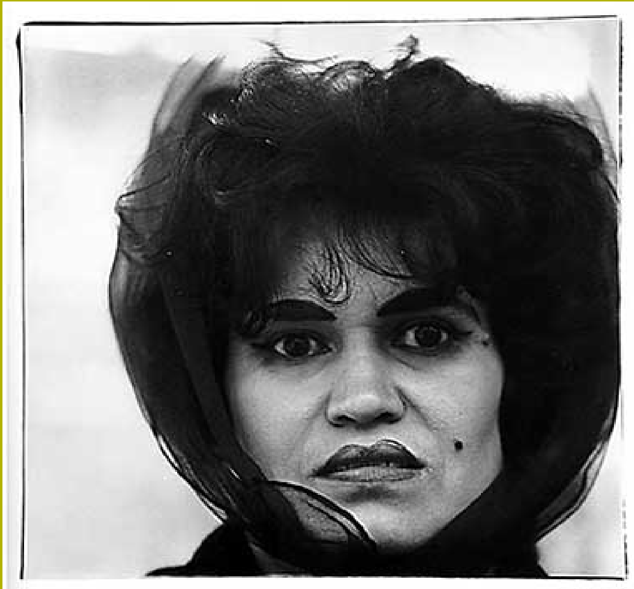
Diane Arbus, Puerto Rican Woman with a Beauty Mark, NYC, 1965