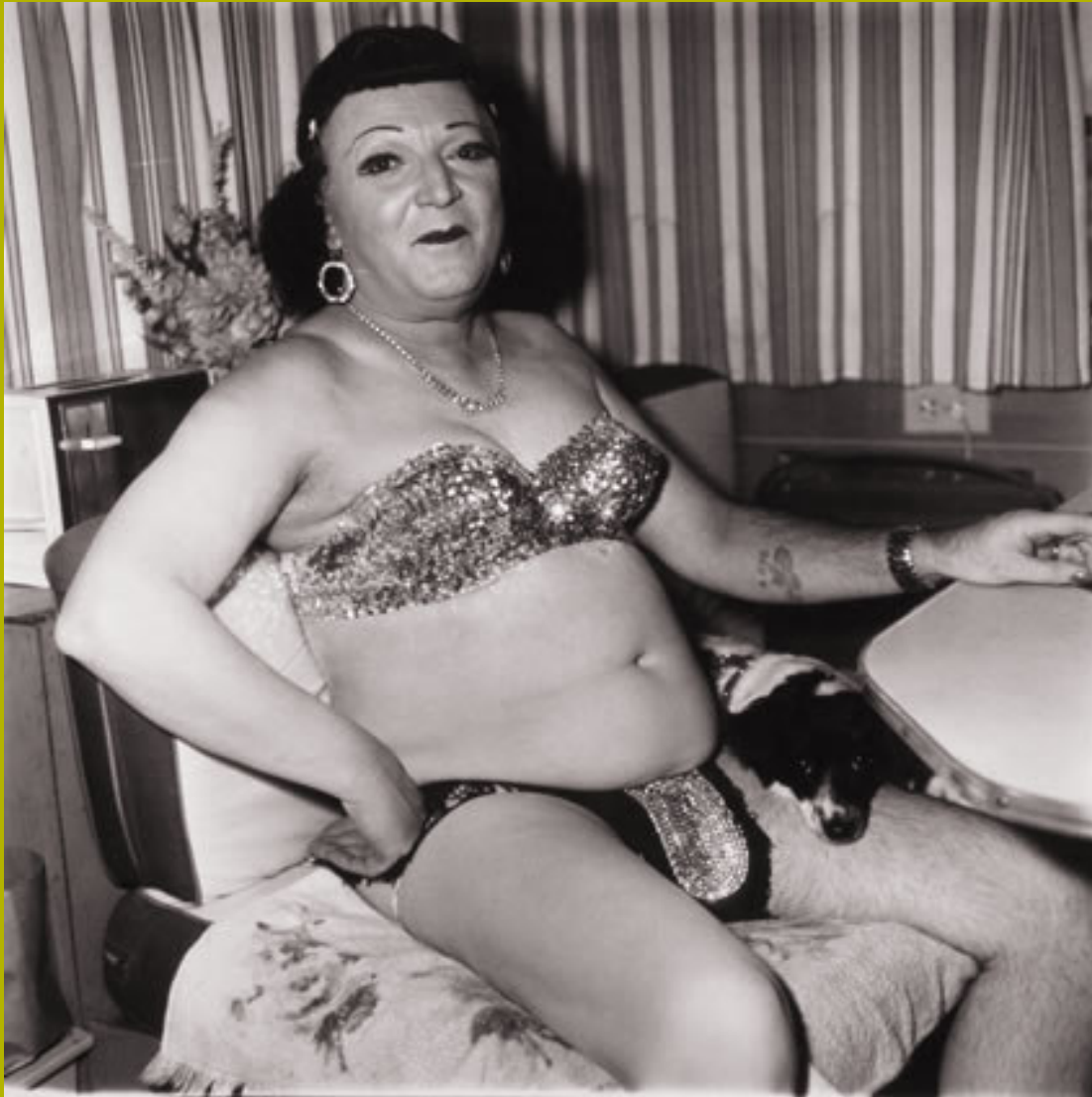
Diane Arbus, Hermaphrodite and a Dog in a Carnival Trailer, MD, 1970