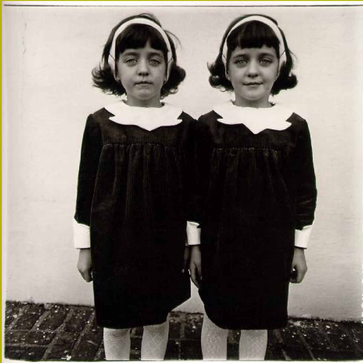
Diane Arbus, Identical Twins, Roselle, NJ, 1967