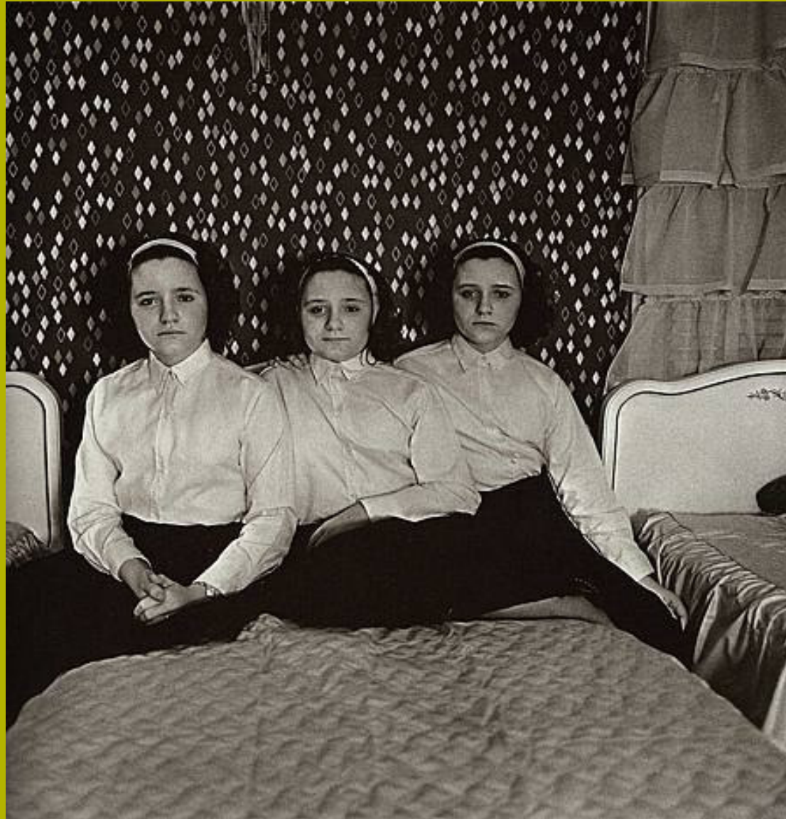
Diane Arbus, Triplets in their Bedroom, N.J., 1963