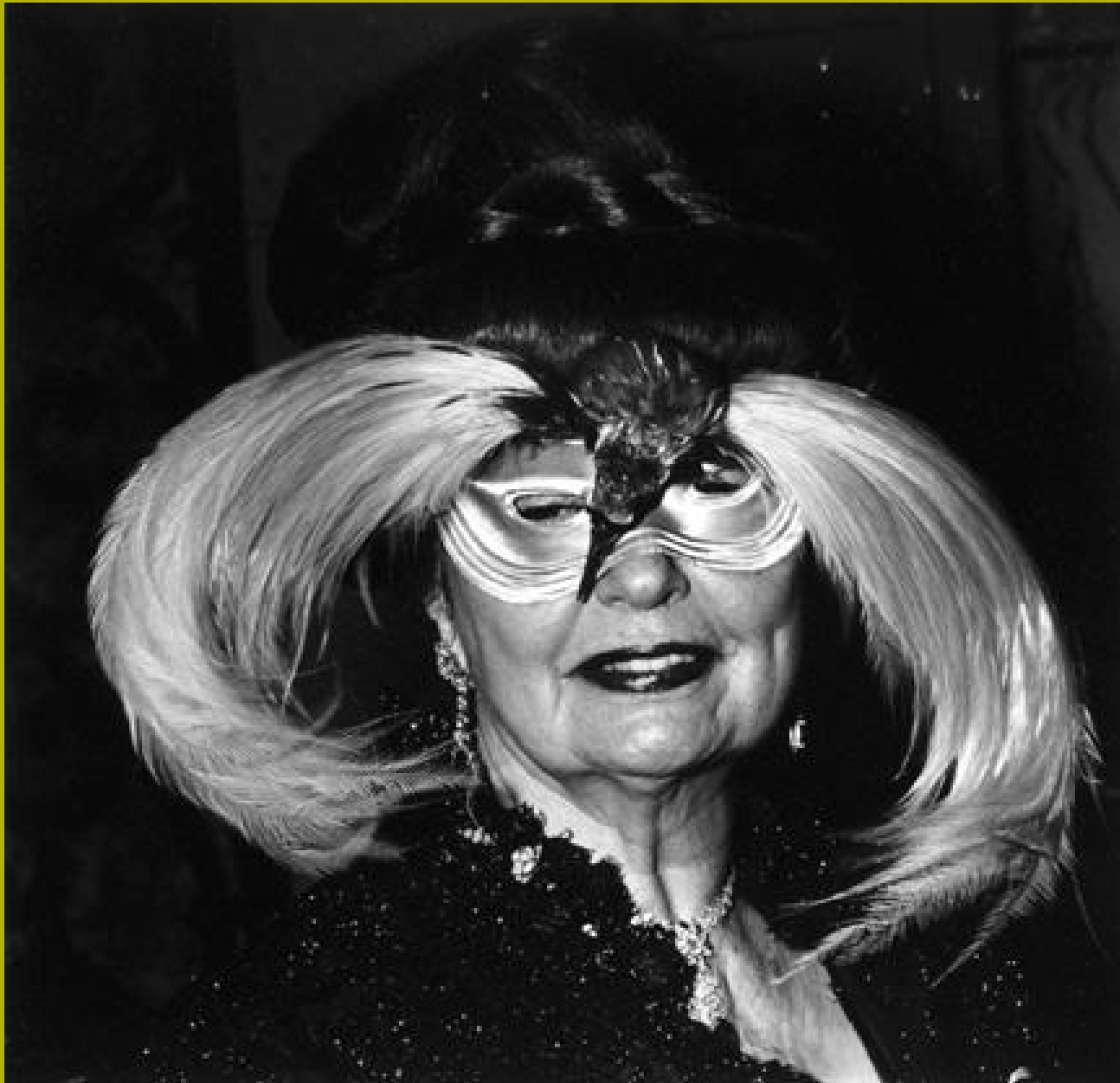
Diane Arbus, Woman With a Bird Mask , 1967