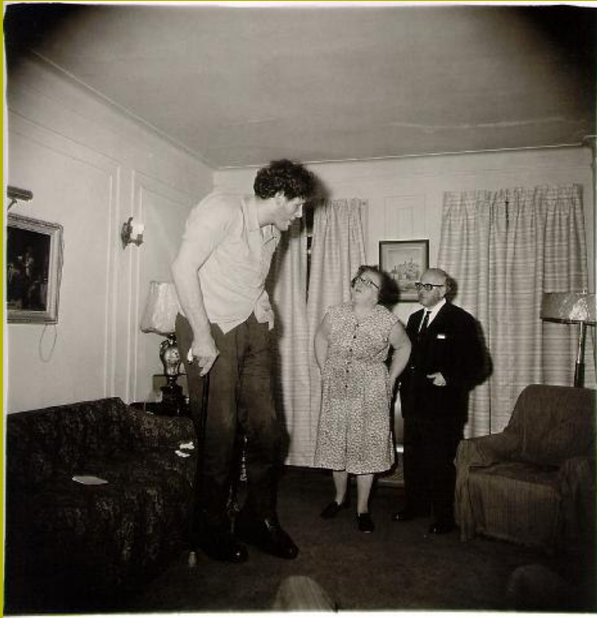
Diane Arbus, A Jewish Giant at Home With His Parents in The Bronx, N.Y., 1970