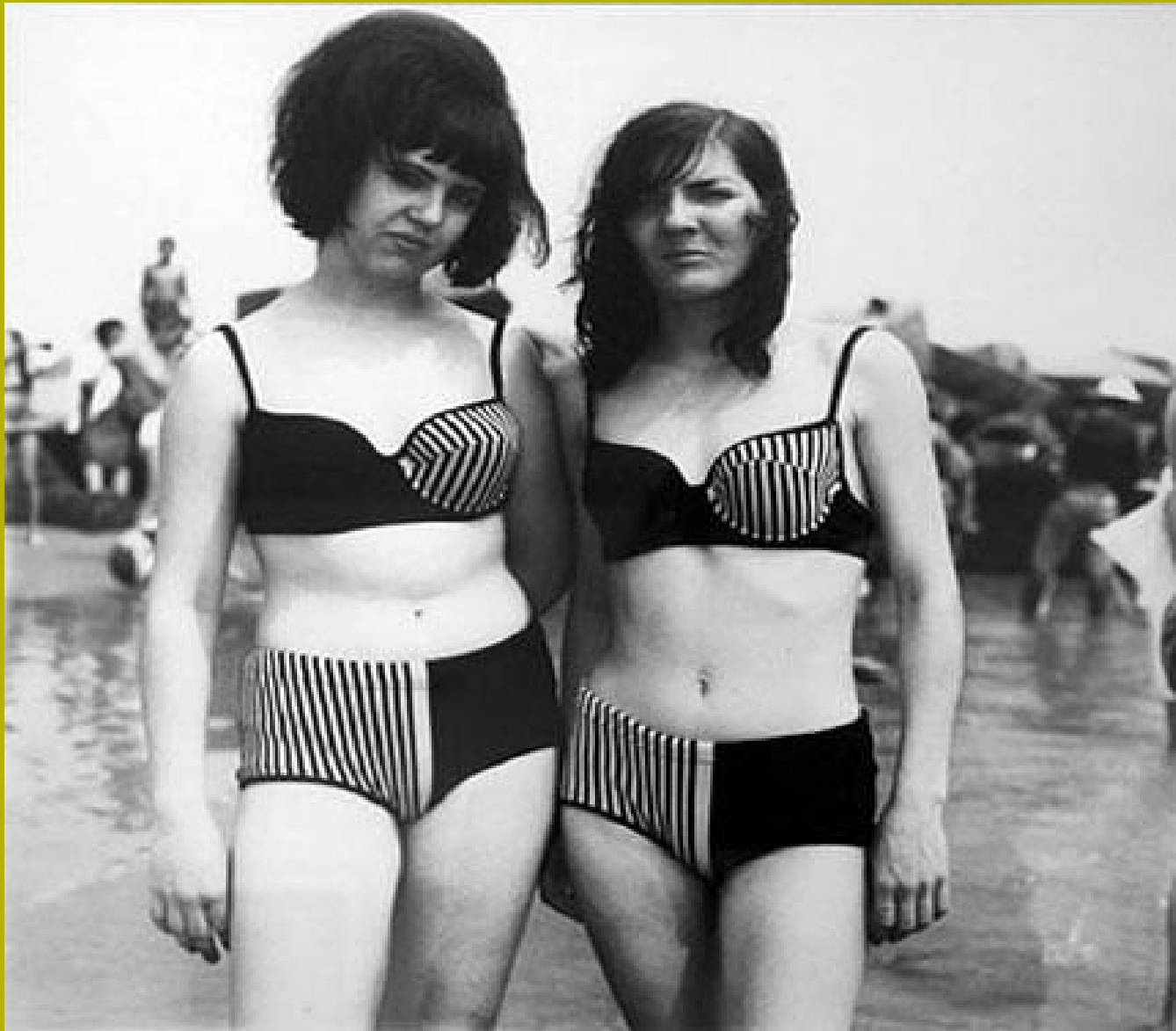
Diane Arbus, Two Girls in Matching Bathing Suits, Coney Island, 1967