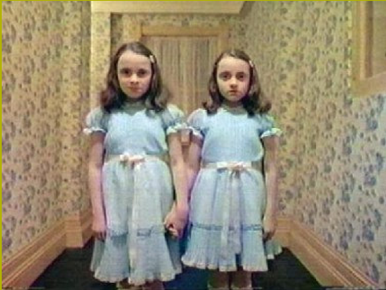
Stanley Kubrick, The Shining , 1980