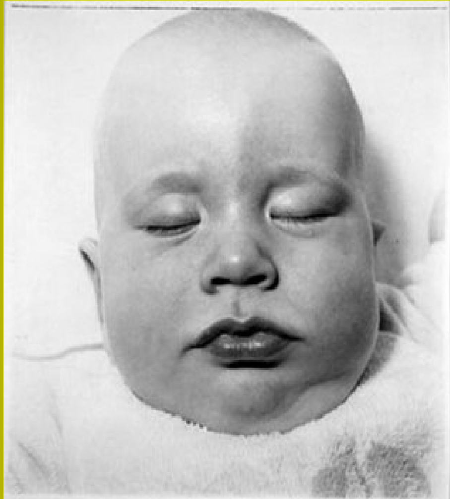
Diane Arbus, A Very Young Baby, NYC, 1968