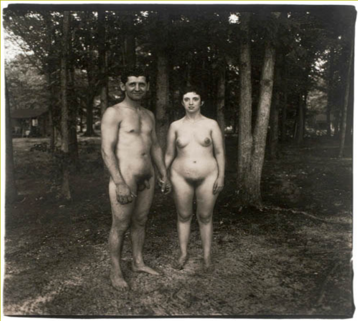
Diane Arbus, A Husband and a Wife in a Nudist Camp, N.J., 1963 ,