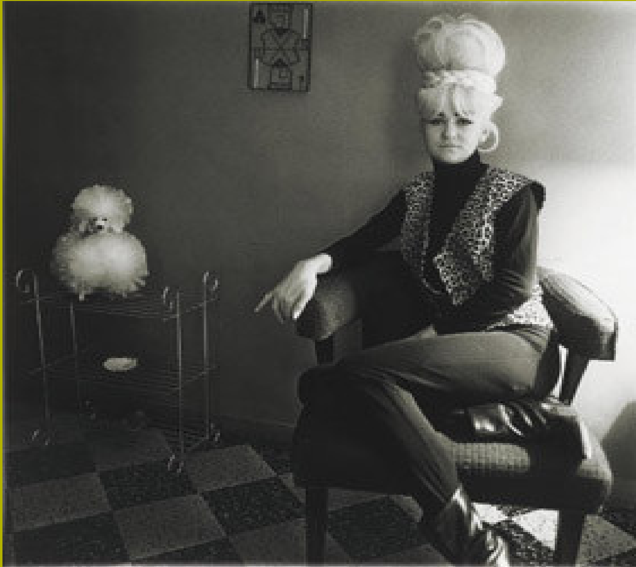
Diane Arbus, Lady Bartender at Home with a Souvenir Dog , 1964