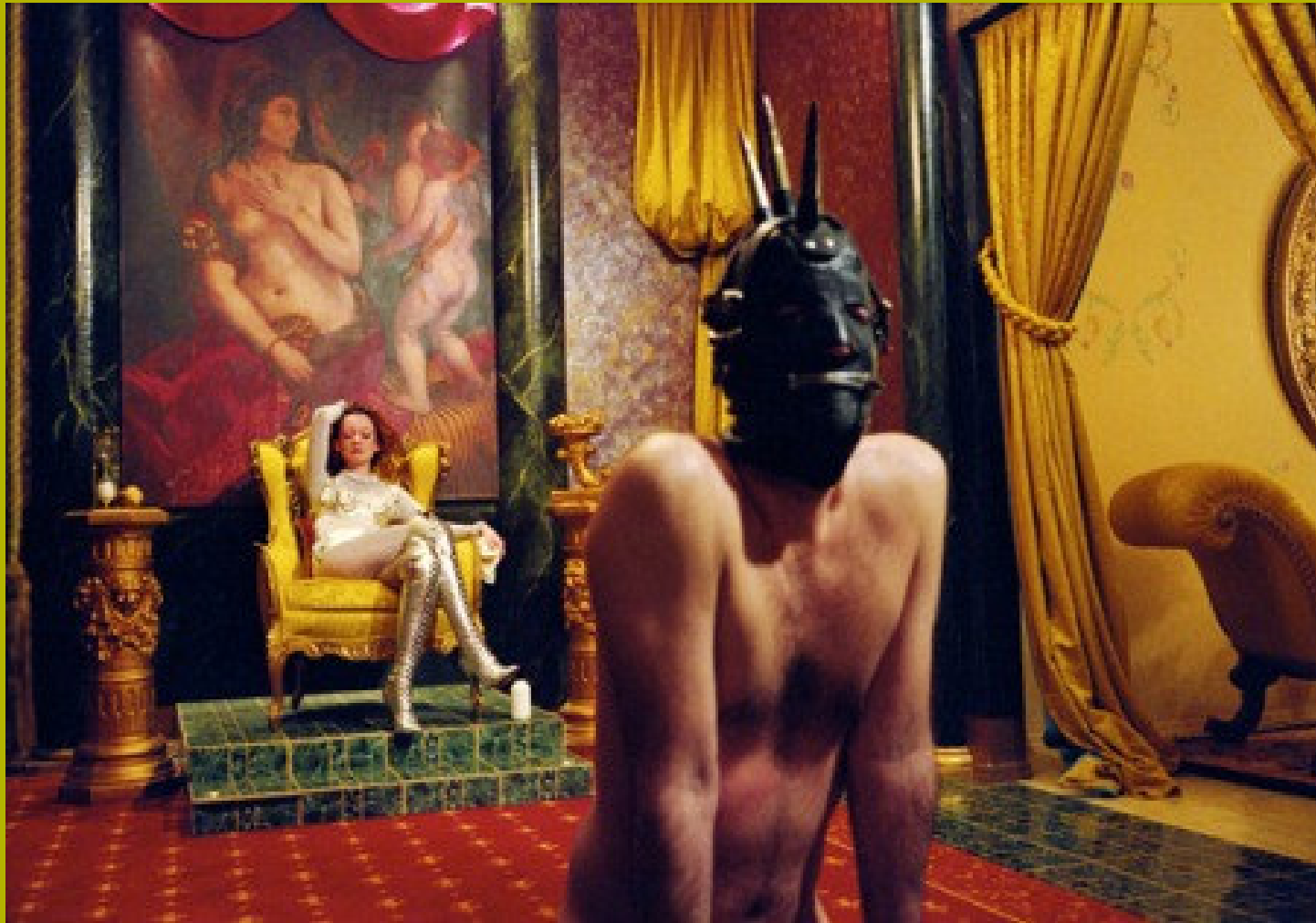
Susan Meiselas, Pandora's Box , 2001