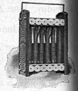
REAR VIEW CASING REMOVED

The above Rheostat is the result of a series of careful experiments and tests aimed to produce an apparatus to meet every requirement of Municipal Authorities and Motion Picture Exhibitors. The resistance is built up with individual coils of "Climax" wire, and any single coil may be replaced without disturbing any other coil, by simply loosening four set screws. A heavy perforated sheet steel casing thoroughly protects and ventilates the coils. Terminals and adjustable switch are mounted on a non-conducting slate base protected by a sheet steel automatic closing cover. Asbestos covered copper wires connect the various coils with switch contacts and all connections are solderless. A convenient handle facilitates handling, especially when Rheostat is hot. All parts are made with jigs and templates insuring interchangeability.