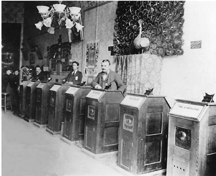
Cinetoscopi a S. Francisco, 1898